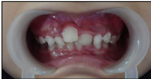
Figure 2. Protrusion of the anterior teeth.

The treatment plan for overcoming the bad habit was established, and a lip bumper was then used. The impaired teeth were first treated, followed by the fabrication and application of a lip bumper. Details about the treatment of the impaired teeth were as follows: fissure sealant on 16 and 26; preventive resin restoration (PRR) type A on 46; PRR type B on 36; GIC filling on 55, 65, 75, 84, and 85; and inlay on 54.