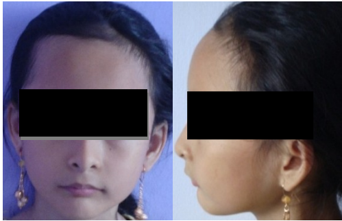
Figure 5. (a) Extraoral facial photograph after 5 months of lip bumper application. (b) Extraoral lateral photograph after 5 months of lip bumper application.