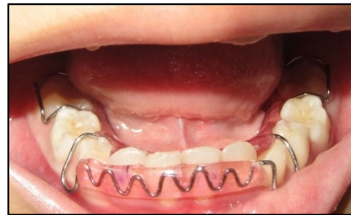
Figure 4. Insertion of a lip bumper in the lower jaw.

The bumper may be used twice a day: 2 h in the morning and during the evening when the child is asleep. The dentist further stated that the time spent on watching TV could be used in applying the bumper in the morning. The parents are encouraged to motivate the child to apply the bumper each night before going to bed and to remove it every morning after waking up. Evaluation or control was conducted once a month. The first evaluation revealed a significant reduction in lip sucking, and finally, after 5 months of application, the patient completely overcame such habit (Figure 5). The treatment was successful. Thus, the protrusion of the upper anterior teeth was then corrected.